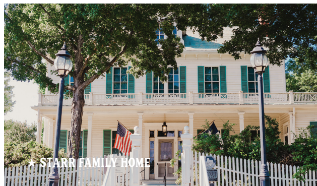
★ STARR FAMILY HOME