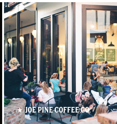
★ JOE PINE COFFEE CO.