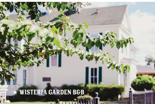
★ WISTERIA GARDEN B&B