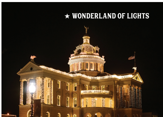
★ WONDERLAND OF LIGHTS