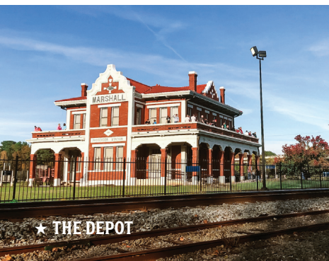
★ THE DEPOT

Harrison County Historic Museum 1 Peter Whetstone Square | 903.935.8417