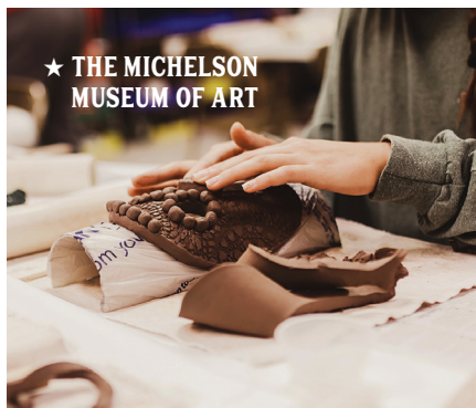
★ THE MICHELSON MUSEUM OF ART

Named by Texas Monthly Magazine as the best small museum in Texas, the Michelson Museum of Art showcases the work of Russian-American artist, Leo Michelson. The collection consists of more than 1,000 paintings, drawings and prints. Other permanent exhibits include 20th century American art from the Gloria and Bernard Kronenberg collection. The museum also displays and features a Discovery Room for young children.