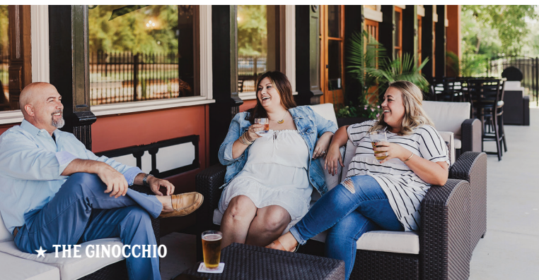
★ THE GINOCCHIO

621 Longs Camp Rd., Karnack 903.679.3427